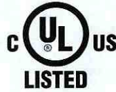
Figure i.42 UL/cUL Mark

The UL/cUL mark applies to products in the United States and Canada and indicates that UL has performed product testing and evaluation and determined that their stringent standards for product safety have been met. For a product to receive UL certification, all components inside that product must also receive UL certification.